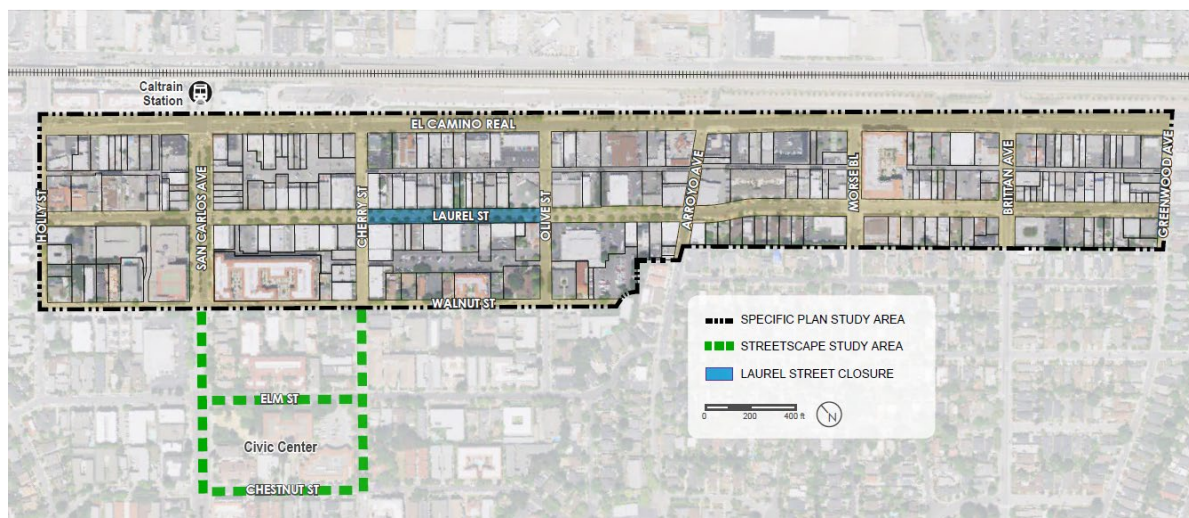
Figure 1. Downtown Specific Plan + Streetscape Master Plan Study Area

The Downtown Specific Plan + Streetscape Master Plan study area (Figure 1) is framed by Holly Street to the north and Greenwood Avenue to the south, with El Camino Real to the east and Walnut Street to the west. The Downtown Specific Plan will also address the streets around the Civic Center: San Carlos Avenue, Cherry Street, Elm Street, and Chestnut Street as indicated by the green dotted line in Figure 1 below.