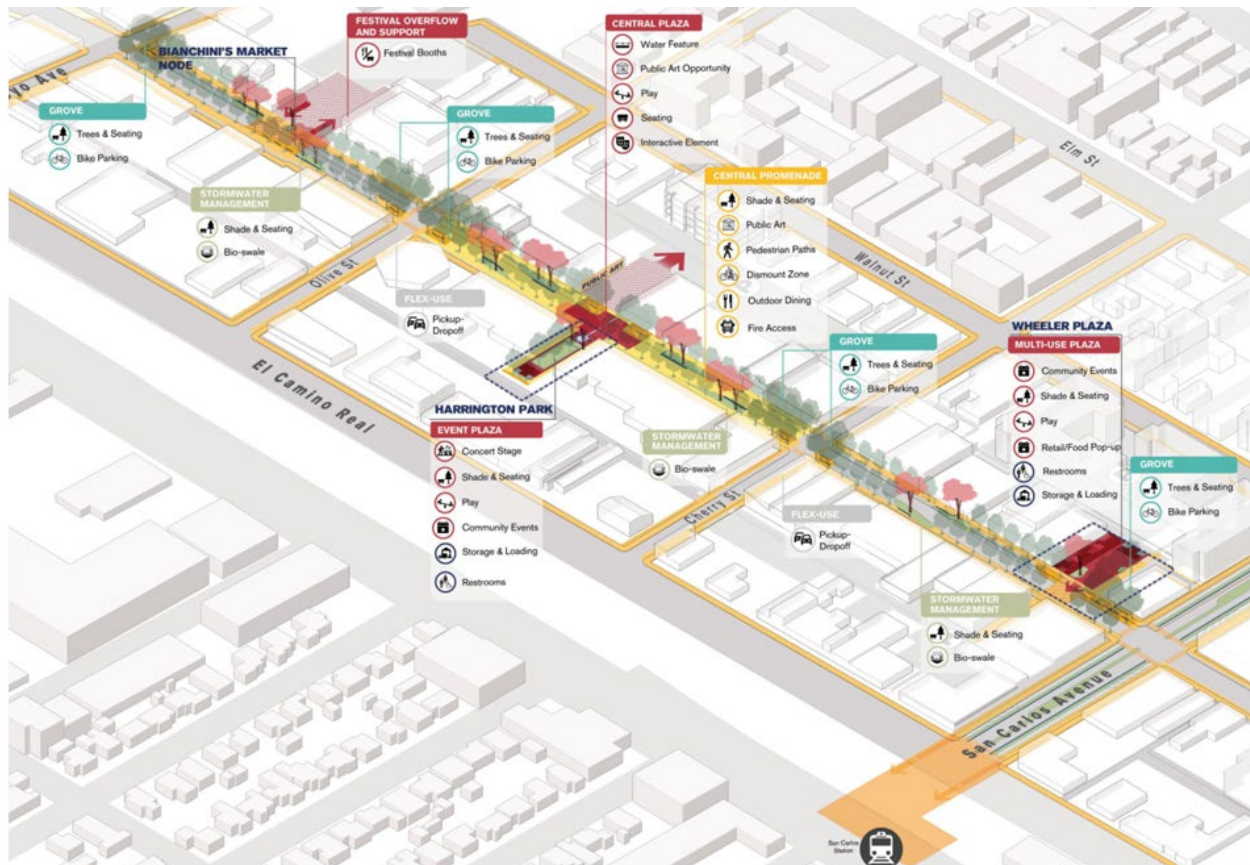
Figure 4. Streetscape Design for 600, 700, and 800 blocks of Laurel Street

At the end of the meeting, the DTAC endorsed the street redesign concepts (see Attachment 1).