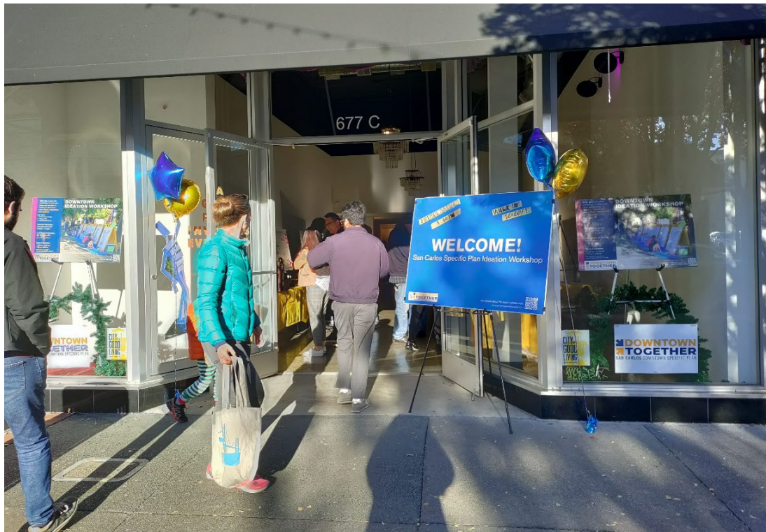
Workshop Venue: 677 Laurel Street

The in-person Ideation Workshop was held at a vacant storefront on the 600 block of Laurel Street for ease of access and for encouraging ample participation by community members. The workshop was attended by approximately 200 community members, who attended the presentation and engaged with the project team to ask questions and provide feedback in one-on-one discussions and on comment cards and sticky notes. The project team also made a temporary installation on the sidewalk to demonstrate the sidewalk expansion concepts and gathered community feedback.