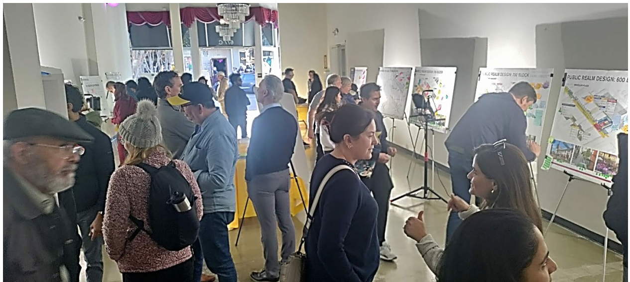
Open House with presentation boards