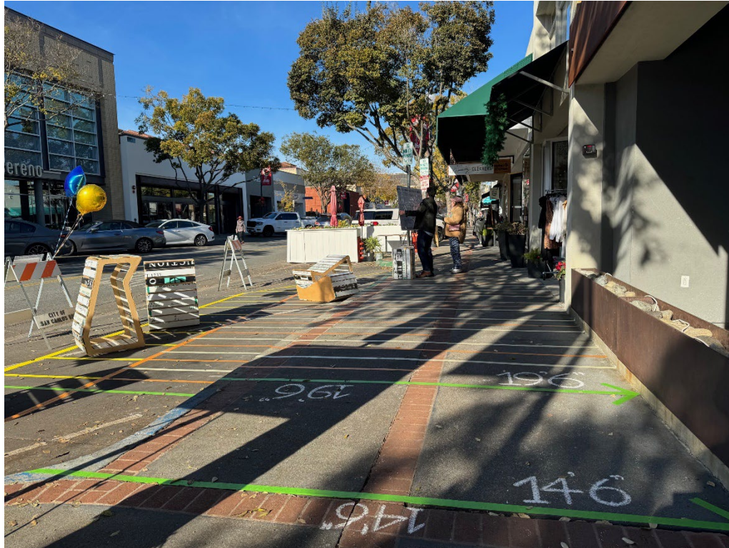
Temporary sidewalk installation for demonstrating sidewalk expansion concepts for the 600 & 800 blocks.