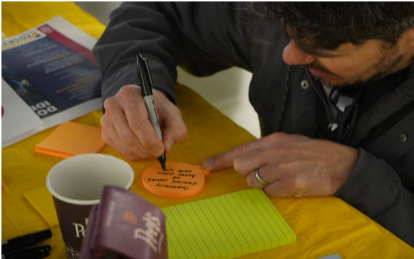
Community member writing feedback during the Open House session